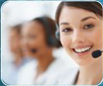
CALL CENTER TRAINING