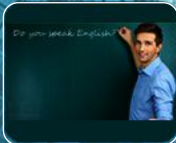
ENGLISH LANGUAGE MODULE(TEFL)